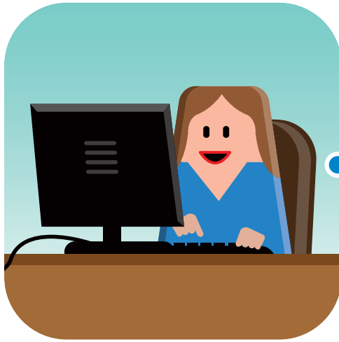
Clinician programs/updates monitor based on patient's condition.