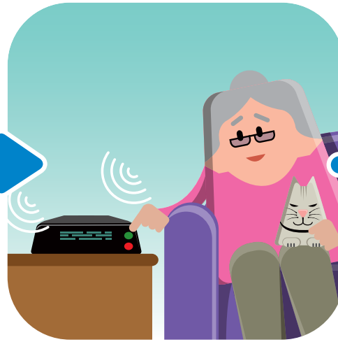
Patient completes vital signs collection and responds to symptom management questions.